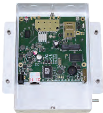
UBTik Custom (open enclosure without cover)