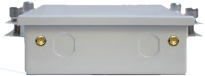
Top view Includes 2 SMA type, and 2 N-type knockouts