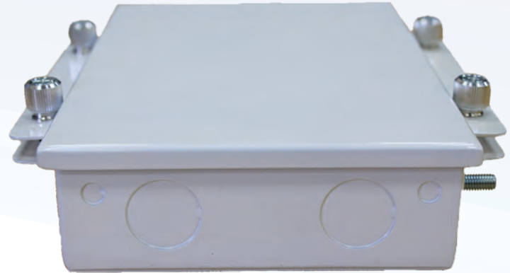
Bottom view Includes 2 SMA type, and 2 RJ45 type knockouts