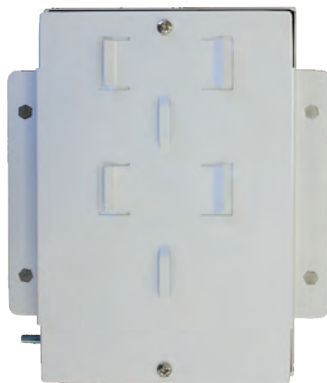
UBTik Custom (back of enclosure)